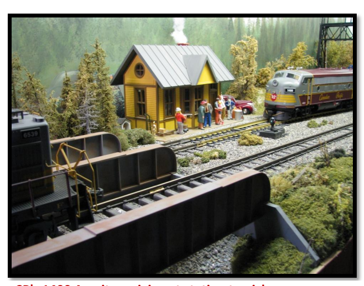
CP's 1400 A unit - arriving at station to pick up passengers

Forget the magazines Dan has trains running through the Loo for you! The washroom that is.