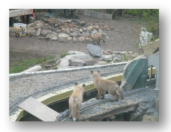
Catastrophe - great calamity or misfortune

Every spring we host a new litter of four red foxes here at DeWinton Station . They love to frolic around the property and investigate the train tunnels and bridges. The mother is always standing guard nearby, they are usually seen in the early mornings running and playing in the rear yard. We love wildlife and have also had porcupine, skunks, badgers, coyotes and other less desirable visitors try to make this their home.