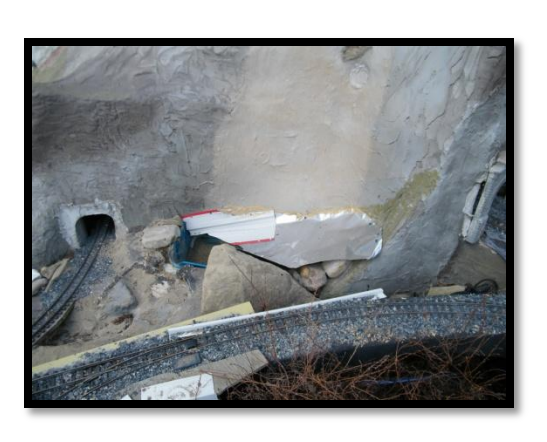
Metal splash guard

With the assistance of my DSGR train buddy Dan Ellis we set to the task of filling in the holding pond with packed sand, then I formed a metal splash guard and sealed to the mountain side with polyurethane which was followed by another covering of a formed fiberglass panel to direct the water flow, then by stones and large rocks to give a natural appearance. Now I will be able to quickly maintain the streambed with a garden hose rather than the daunting task of draining the pond and removing debris with a shop wet vacuum on a regular basis.