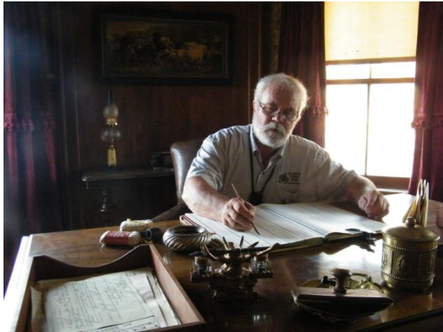
Myself as the "Railway Tycoon"

hair color being naturally white from aging. I had a great time over the next month and met several wonderful people, making new friends and contacts in the casting department for future opportunities to be called upon if needed once again.